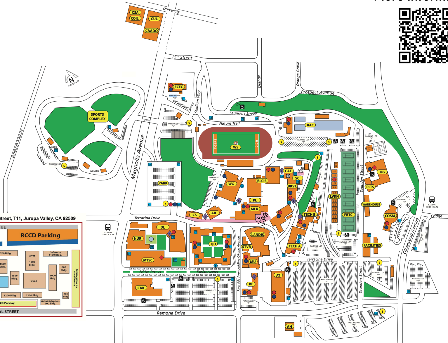
Rubidoux Annex • 4250 Opal Street, T11, Jurupa Valley, CA 92509